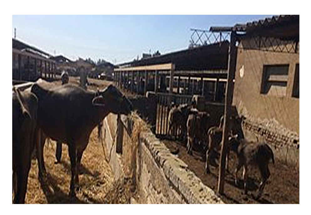
Figure 2. Fence-line weaning system

Calf diets were weighed and offered to the animals twice daily at 8:00 am and at 4:00 pm with allowance of 15 % refusal in equal quantities for each group. Both of the consumed diets and